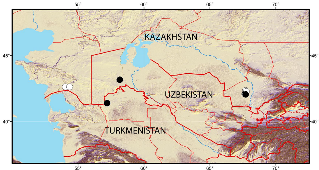
Fig. 6: Collection localities of Oculicosa supermirabilis Zyuzin, 1993. Closed dots – original data, open dots – literature-derived data.

kent, Shymkent] Area, Otrar Distr., Kyzylkum Desert, N foothills of Karaktau [=Kairakta] Hills, c. 43.8 km NW of Bairkum, nr. Tabakbulak (42°21'26.7"N, 67°41'56.3"E), clayey soil, c. 225 m. a.s.l., 23-25.05.1993, A. A. Zyuzin leg. – (3) Kazakhstan, South Kazakhstan [=Chimkent, Shymkent] Area, Arys' Distr., Kyzylkum Desert, c. 35.2 km NW of Bairkum, Karaktau [=Kairakta] Hills, Karamola Mt., top part (42°16'48.4"N, 67°45'28.7"E), c. 376 m. a.s.l., 29-31.05.1993, A. A. Zyuzin leg.