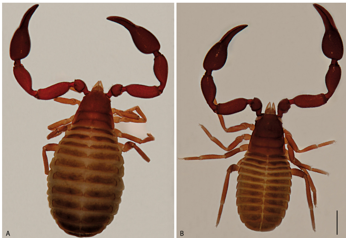
Fig. 2: Megachernes pavlovskyi from Deh Sheikh cave. A. Female. B. Male. Scale: 1 mm.

1 female, 4 males) were examined in detail. The cave is situated in the mountains around the village of Dehsheikh, north-west of the city of Yasuj, in Kohgiluyeh and Boyer-Ahmad Province (30°57'22"N; 51°14'17"E; 1735 m a.s.l.; Fig. 1). The temperature inside the cave is constant, about 15.5–16.5 °C. The relative humidity was measured only on the visiting days; its values were between 72 and 84 %. Unfortunately, due to human activities, some parts of the Deh Sheikh cave have been destroyed and animal life here is endangered.