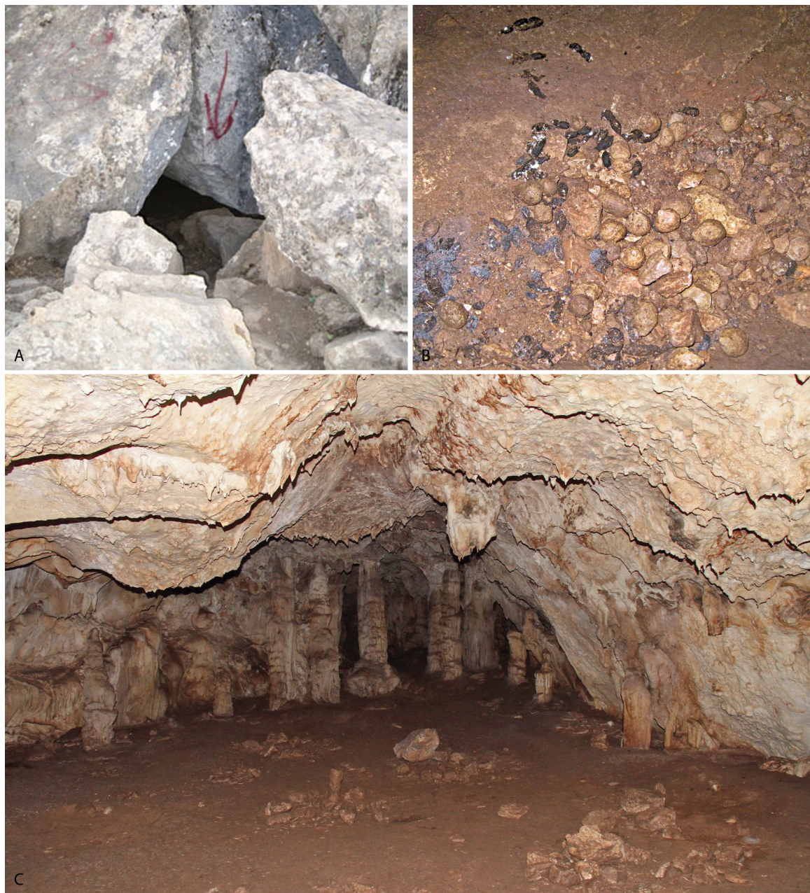
Fig. 1: Deh Sheikh cave, in which Megachernes pavlovskyi was found. A. Cave entrance. B. Detail of porcupine den. C. Cave interior.