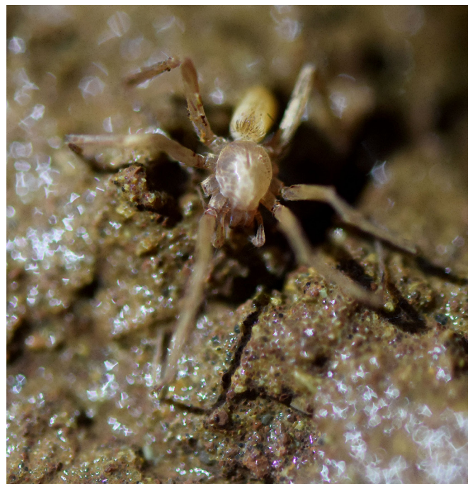
Fig. 1: Agraecina agadirensis , male (Morocco, Tizgui, Imi Ougoug, Ifri Ouado cave)

Agraecina agadirensis Lecigne et al. 2020: p.13, figs 1a, 4a-h, 5a-b (descr. female)