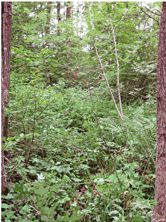
Fig. 2: Mixed dense grove (site 2).

One of the species discovered, Enoplognatha thoracica , has been listed as a vulnerable species (VU)