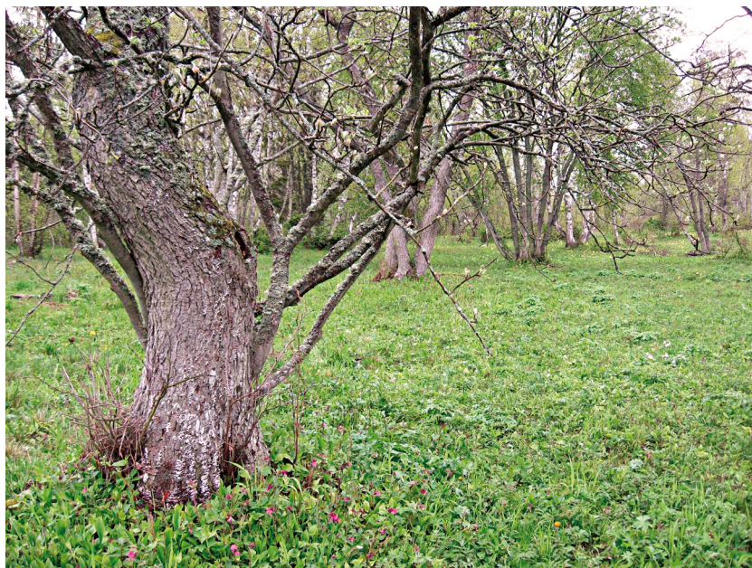
Fig. 3: Wooded meadow (site 5).

in the recent Finnish Red Data Book (Pajunen et al. 2010). Jungfruskär (where the species was found on both wooded meadows) represents its third locality in Finland. In addition, Micaria fulgens , found in wooded aspen pasture, is listed as NT (nearly threatened) in the Red Data Book.