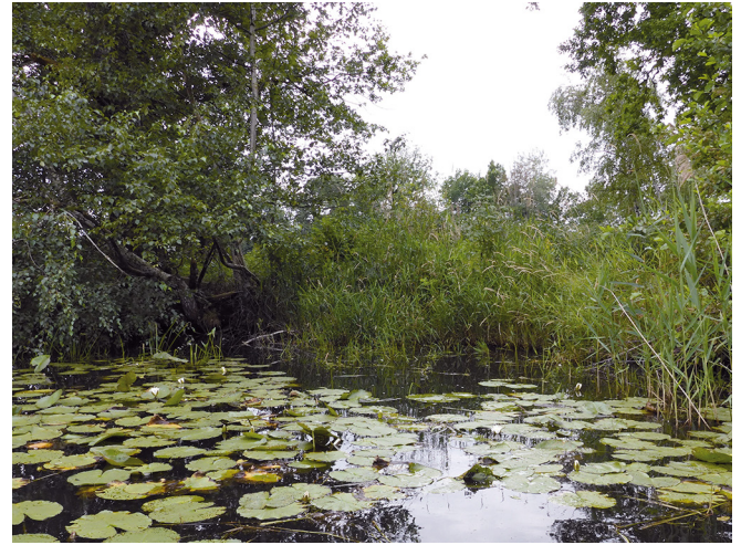
Fig. 6: Collecting site of Dolomedes plantarius at the Lochteich in the pond region Rauden

(Arachnologische Gesellschaft 2022). By contrast, its sister species D. plantarius had previously been recorded only once in Saxony, in 1948 (Graul 1969). This may be connected to the habitat preferences of the species and its lower adaptability compared to D. fimbriatus . Dickel et al. (2020) found higher demands of D. plantarius with regard to the structural richness of the shore vegetation, sunlight and water quality. Also, according to Duffey (1995), the species avoids highly eutrophic or polluted waters. However, the ponds in the present study are managed – the fish stock is fed and thus the waters are eutrophic – as can be seen in Tab. 2. Although these values are based on single measurements in summer, they show a high nutrient content of the ponds. Thus, we can confirm the occurrence of D. plantarius in eutrophic fish ponds (Holec 2000).