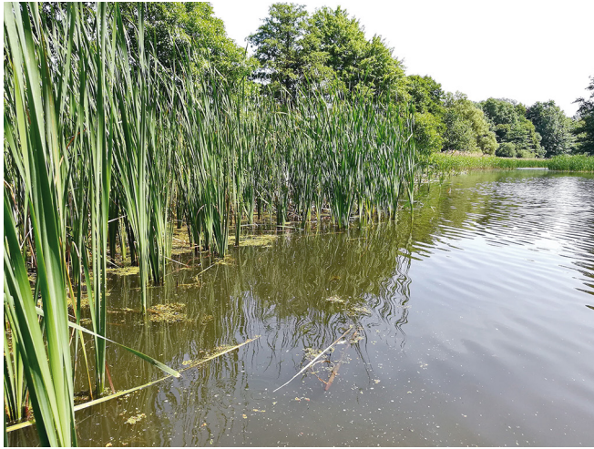
Fig. 5: Collecting site of Dolomedes plantarius at the Thronteich in the pond region Kauppa