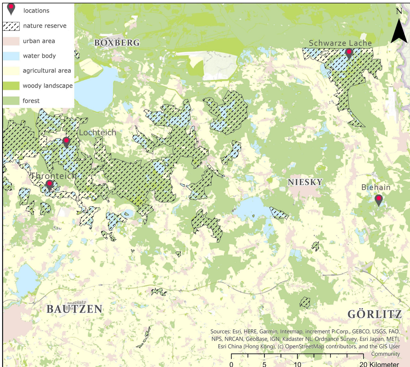
Fig. 2: New localities of Dolomedes plantarius in Upper Lusatia, Saxony

The present work is not a systematic survey of D. plantarius , but a collection of individual records. The aim of this publication is to present localities of the species in eastern Saxony and thus to provide a first basis for a distribution map and for conservation measures in Saxony.