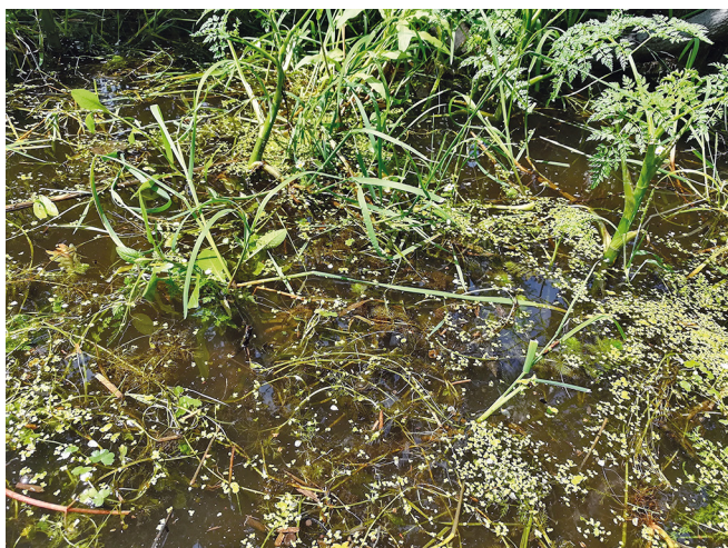
Fig. 3: Collecting site of Dolomedes plantarius at the Schwarze Lache in the Niederspree nature reserve

Localities three and four, sampled on 11. Sep. 2019 and 21. Jul. 2021, respectively, are located in the biosphere reserve “Oberlausitzer Heide- und Teichlandschaft”, in the Kauppa and Rauden pond areas. Sustainable management of these carp ponds aims to preserve the unique cultural landscape.