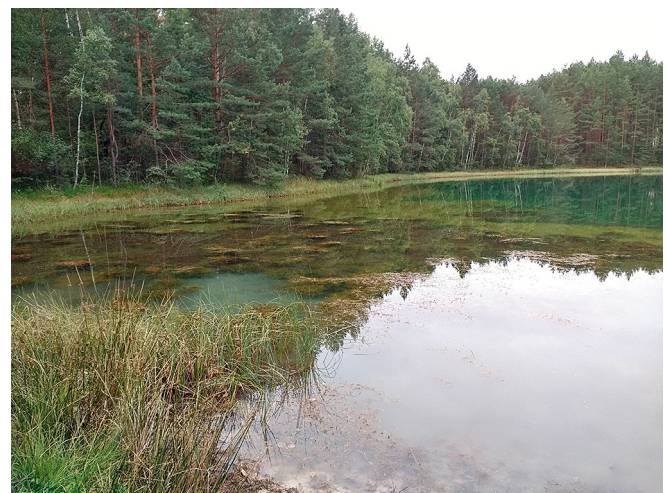
Fig. 4: Collecting site of Dolomedes plantarius close to the villages Biehain and Kaltwasser

There have been several previous studies on the habitat requirements of the two European Dolomedes species and how commonly each occurs. Dolomedes fimbriatus is a widespread species in the north-eastern part of Saxony, with a concentration in the biosphere reserve “Oberlausitzer Heide- und Teichlandschaft” and in the nature reserve Niederspree