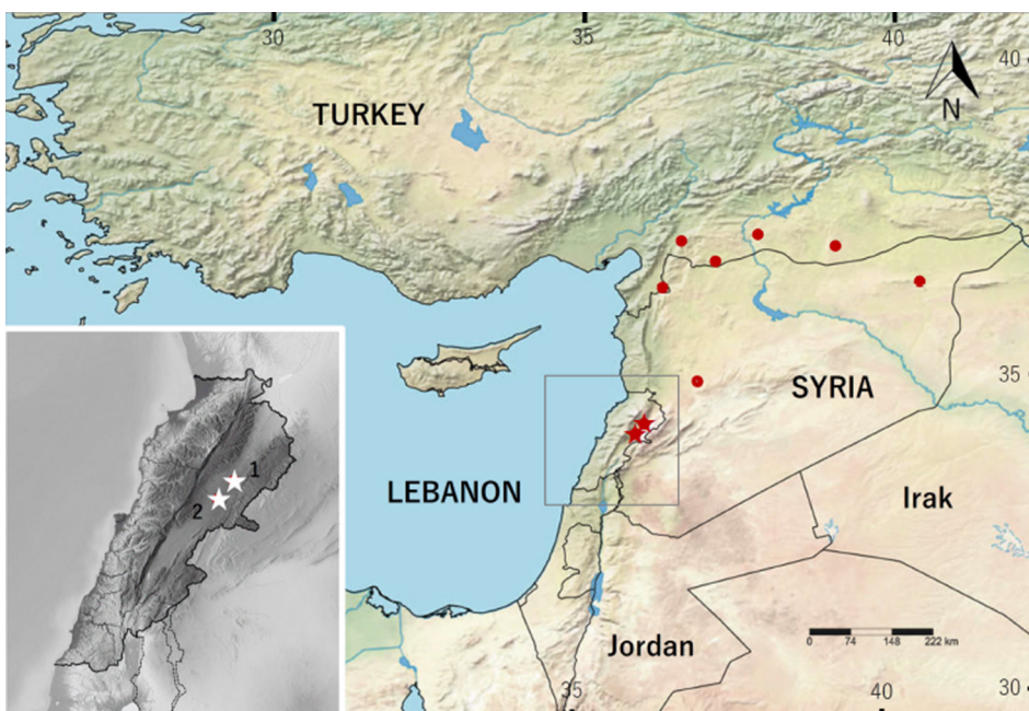
Fig. 2: Map showing collecting localities of Leiurus abdullahbayrami in Lebanon (stars in the main map and inset) and the current species' distribution (red dots), 1 – Maqneh, 2 – Brital

The trichobothrium db on the fixed finger of the pedipalp is located between trichobothria est and esb in the Lebanese specimens, as in the specimens from Turkey. On the other